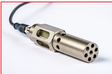
Easy to clean and robust measuring probe