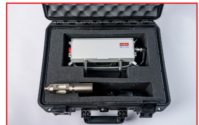
Protective case included in the delivery contents